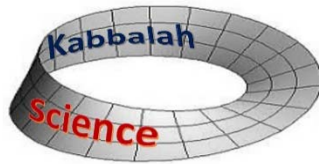
A Möbius strip reflecting the ultimately singular nature of Kabbalah and science

According to the teachings of esoteric Judaism, all knowledge, both spiritual and material wisdom, originally coexisted in a seamless unity within a higher dimension reality. Together, these two modes of wisdom comprised a larger, all-encompassing Universal Torah (Torah literally meaning “instruction” or “teachings”). A collapse (i.e., the episode of the eating from the Tree of Knowledge), however, ensued in which the database of all knowledge split itself into “spiritual” and “material” planes of existence. Thus, we have the roots of the conflict between “religion” and “science.” Yet, any given spiritual or technological truth can only be one of two sides of the same coin. Thus, the material world is also a mode of spirituality, only externalized and concretized. Vice-versa, the spiritual world is a mode of the material reality, only internalized and spiritualized. The ancient teachings of traditional Kabbalah, together with scientific discovery and its technology, are essential in ushering in, and even accelerating, the incoming and final stage of global evolution, long known as the Messianic Era. Modern science and technology are one of the very manifestations of the messianic process itself.